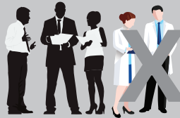
No Medical Judgment