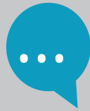
No Stakeholder Dialog